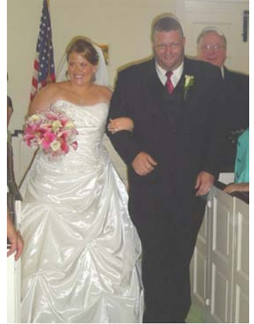
July 9, 2011