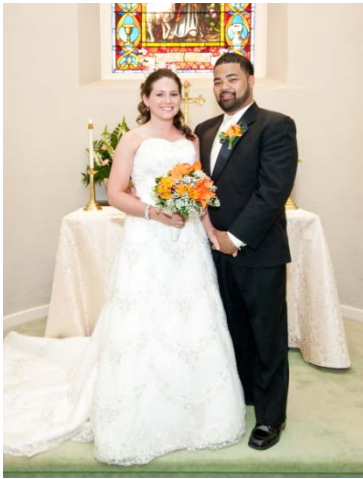
June 17, 2011